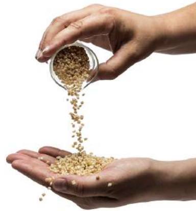
Hemp-based plastic ready to be molded

The possibilities offered in transports are virtually infinite: hemp is currently being studied in a R&D project promoted by SNCF, the French railway company, with the aim of substituting all petrol based parts of a train, but hemp materials could perfectly fit the needs of other sectors such the aviation and aerospace industry.