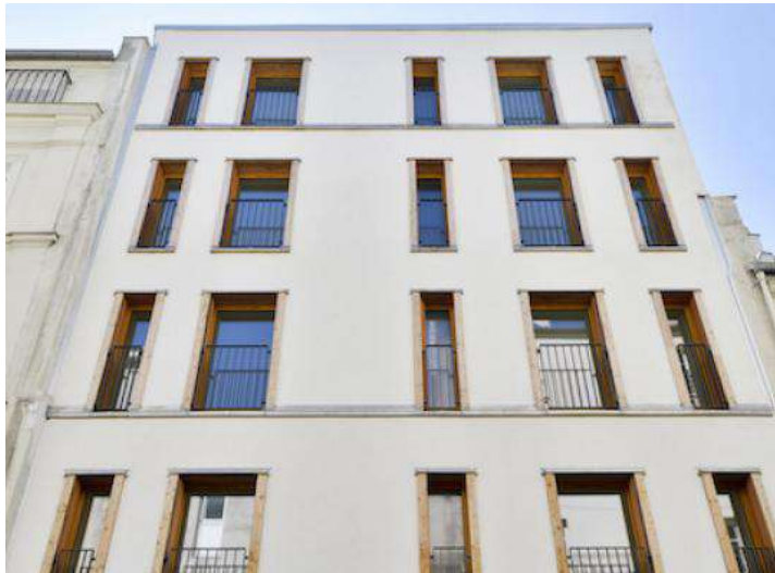
Examples of a hempcrete building in Paris, France

The examples of hemp in the construction industry keep multiplying and gaining in efficiency. A three-story building at Bath University was constructed using a hemp-lime envelope and was so effective that they switched off all heating, cooling, and humidity control for over a year, maintaining steadier conditions than in their traditionally equipped stores, reducing emissions while saving a huge amount of energy. Very