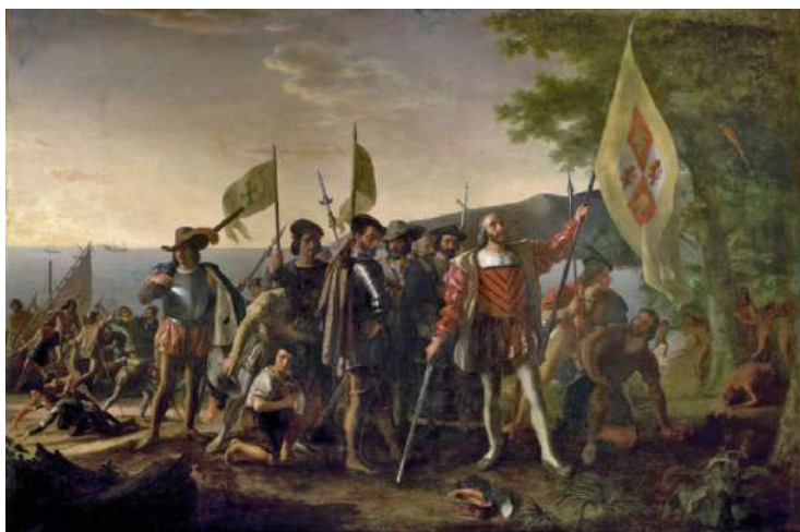
Landing of Columbus, John Vanderlyn (1775-1852)

A huge consumers market existed for hemp fibres until after World War II . In the 1930s Russia's hemp area sown was almost 700,000 hectares, providing for 40% of Europe's hemp needs. In comparison, Italy and Yugoslavia accounted for up to 100,000 hectares each. Currently the EU combined barely grows 50,000 hectares.