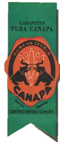
Italian hemp quality seal (1953)

During 1953 -1954 an Italian magazine entirely dedicated to hemp, brilliantly listed all the advantages of using hemp products in the modern house, featuring famous cinema and TV stars and promoting a quality seal of Italian hemp production. A few years after, things changed quite rapidly. Hemp production in Europe had a sharp decline as soon as the new synthetic fibres made their grand debut in the 1950s. Only France and some Eastern countries aligned to the Soviet Union retained their expertise and limited manufacturing facilities. Elsewhere, thousands of companies, working with natural fibres closed under the pressure of competition from new man-made fibre products.