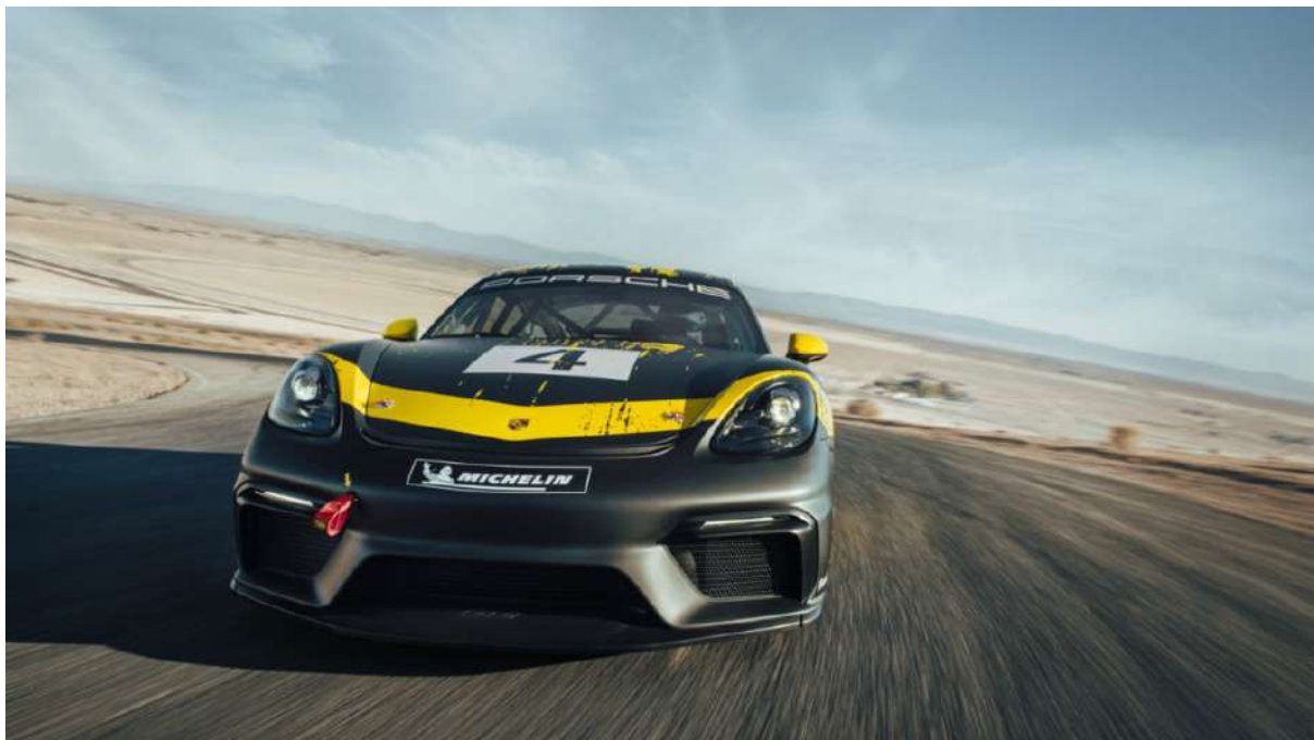
The 718 Cayman GT4 Clubsport: the driver and co-driver doors and the rear wing are made of an organic fibre mix, sourced from flax and hemp fibres.

It has been calculated that the serial implementation of the lightweight biomaterials on the high-volume vehicles will deliver a reduction of 40,000 t of CO 2 emissions and the ability to drive an additional 325 million km with the same quantity of fuel.