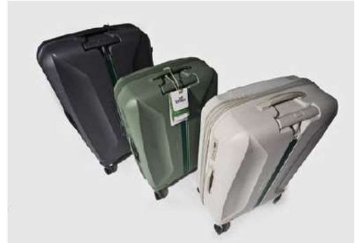
Hemp luggage, produced in EU

By now, everyone on earth is aware that, whilst plastic is tremendously useful, the sheer amount of this synthetic material in our lives has become an environmental problem both at sea and on land, with a demonstrable impact on our environment and ecosystem. Governments have begun to acknowledge this and there is a growing expectation amongst the citizens of Europe that there will be some form of intervention.