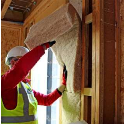
Example of hemp insulation

The built environment in the EU is responsible for approximately 40% of EU energy consumption and 36% of the CO 2 emissions. The construction sector accounts for about 50% of all extracted material and is responsible for over 35% of the EU's total waste generation. At present, about 35% of the EU's buildings are over 50 years old and almost 75% of the building stock is energy inefficient. The annual renovation rate of the building stock will need to at least double to reach the EU's energy efficiency and climate objectives (today it varies from 0.4% to 1.2%). In parallel, 50 million consumers struggle to keep their